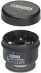
Connection element with spring-cage terminal blocks for base mounting

Please be informed that the data shown in this PDF Document is generated from our Online Catalog. Please find the complete data in the user's documentation. Our General Terms of Use for Downloads are valid ( http://phoenixcontact.com/download )